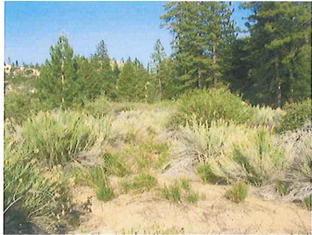
HORSE THIEF CANYON West of Mutau Flats